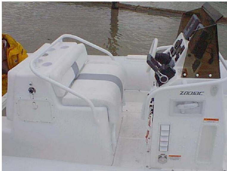
Engine cover forms crew seat/bolster and console can be equipped and sized accordingly